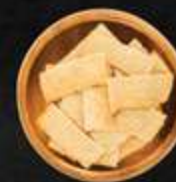
Fish Cake $2