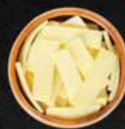
Bamboo Shoots $2