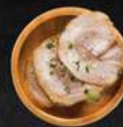
Chashu Pork $3/ 2pcs