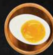
Half Marinated Egg $1