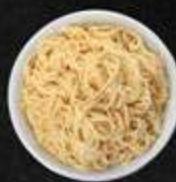
Extra Straight Noodle $3