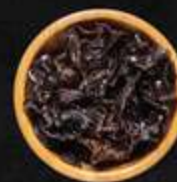
Kigurage Mushroom $2