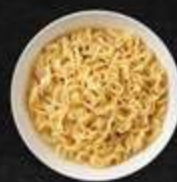
Extra Wavy Noodle $3