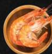
Shrimp $3/ 2pcs